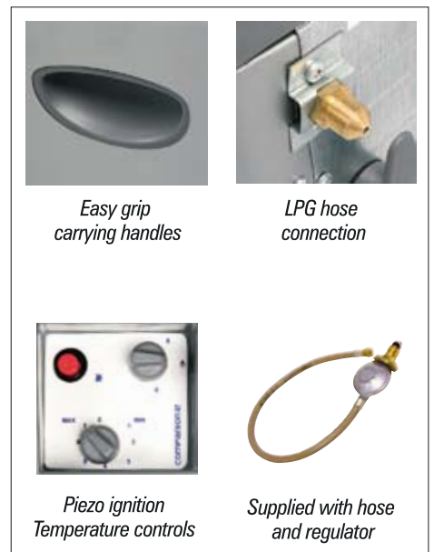
Easy grip carrying handles